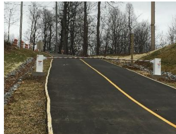
Argyle Lane Gate - Almost Ready! Dec. 27, 2018

For those of you who are new to Kenmure, you may not know that the KPOA Office is more than a place to conduct KPOA business. We have a wonderful library stocked with many fiction and nonfiction books as well as a large collection of jigsaw puzzles. There is no check-out procedure for the books or puzzles. Take as many as you want and return them at your leisure. We accept donations of puzzles and books, but we don't have shelf room for your old textbooks, cookbooks, travel books or other books that would not be of general interest to Kenmure readers. Current novels and biographies are always welcome. The Hendersonville Library has an annual book sale and would gladly accept books that the Kenmure library can't accept. The KPOA Office building also has a Box Exchange. Many of you who have moved in to or out of Kenmure have faced the dilemma of what to do with all of the moving boxes that are left over after a move, or where do you acquire moving boxes without paying for them. We gladly accept flattened cardboard boxes in good condition. Due to space limitations, we are not able to accept packing paper, bubble wrap or any other packing supplies – just cardboard boxes of any size.